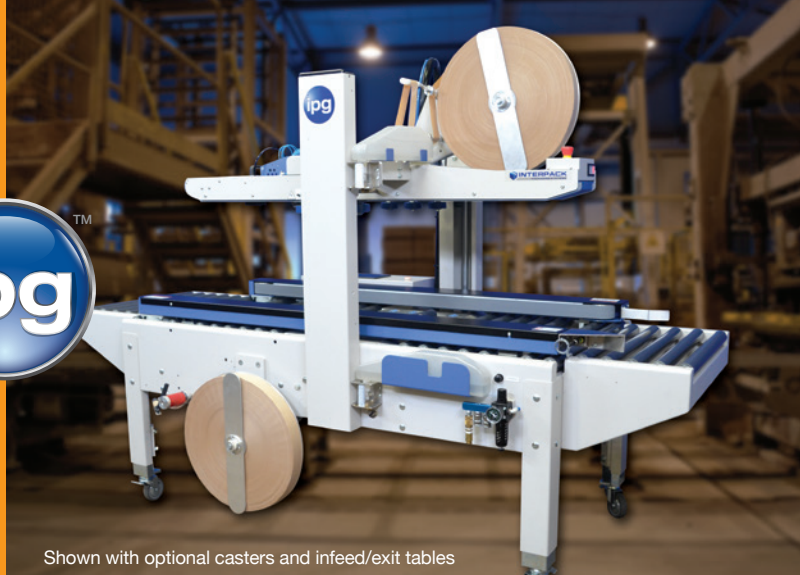
Shown with optional casters and infeed/exit tables